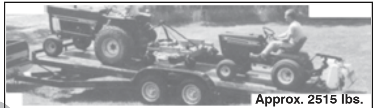
Approx. 2515 lbs.

Picture shows 22' Partial Tilt 14,000 G.V.W. lowboy equipment trailer