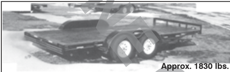
Approx. 1830 lbs.

These good-looking Canadian-made trailers are well-built with high-grade structural steel channel frames, thicker steel than the competition. Black is the standard color. The wiring is enclosed and protected with a 7 prong plug. Standard equipment includes safety chains, a front jack, 4 wheel electric brakes, break-away equipment (including battery), 2 5/16 coupler, stake pockets, D.O.T. approved lighting, and radial tires. Comes with removeable (bolt-on) fenders except tilts and split tilts. Most importantly, Rainbow probably has the best warranty in the industry. (Five year structural warranty)