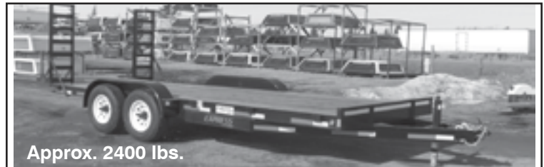
Approx. 2400 lbs.

Picture shows 16' Excursion 7000 G.V.W. car & equip. lowboy with slide-in ramps